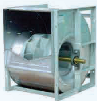
DABD SERIES : DIDW Backward Curved Blowers