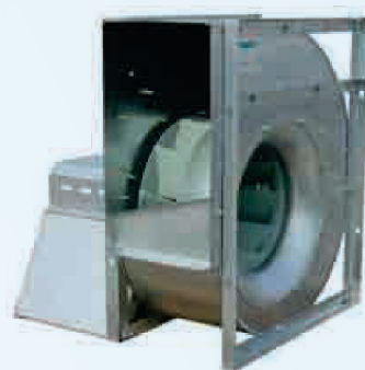
DAB SERIES : SISW Backward Curved Blowers