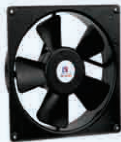
8" Square Fan