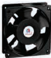
4" Square Fan